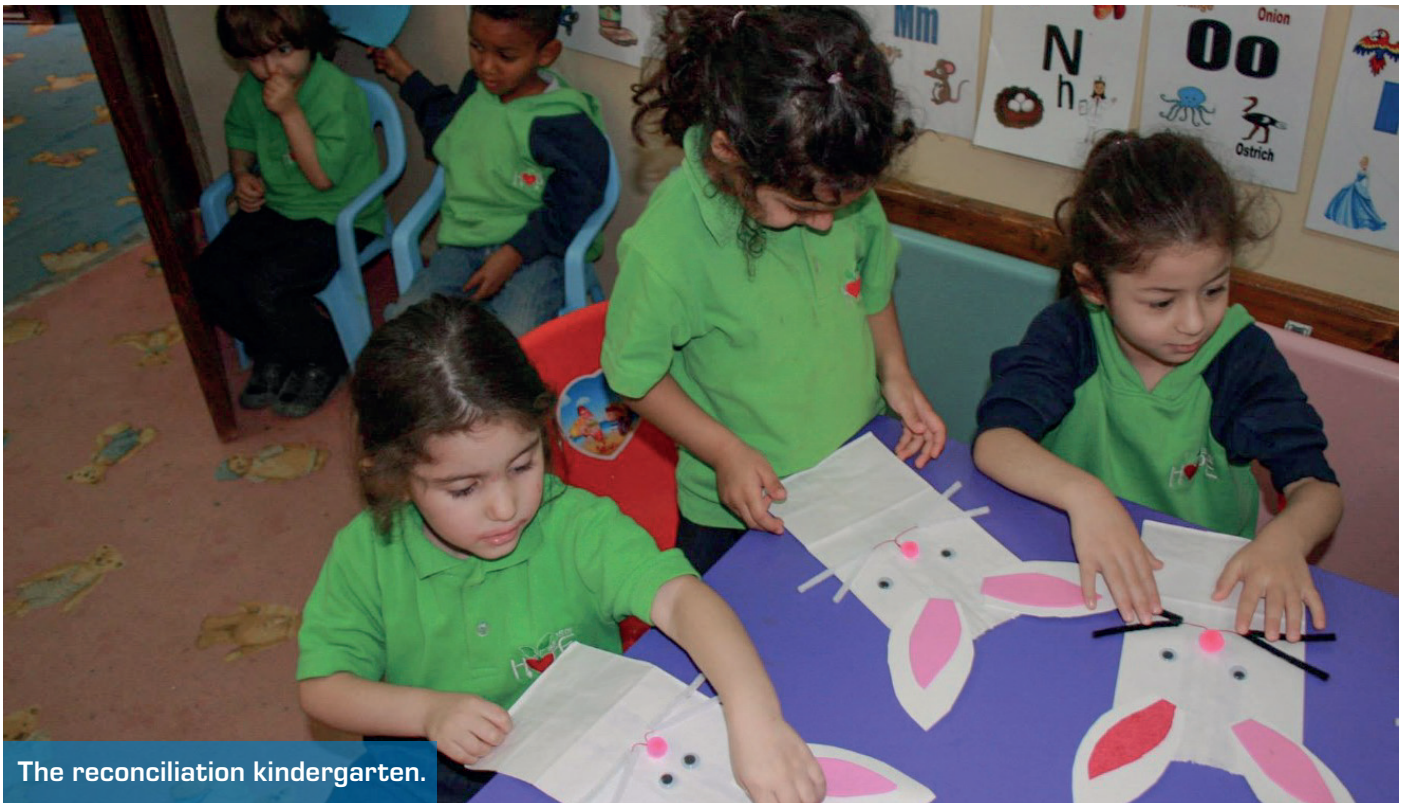
The reconciliation kindergarten.

Last year, the Palestinian-Israeli conflict unfortunately escalated once again. In this environment of war and hatred, our reconciliation work between the two peoples is immensely important. Through projects in the West Bank which we have been supporting for years, neglected refugee children are not only given an education, but are also shown strategies for reconciliation which the teachers themselves model. Specifically, our educational facilities consist of a kindergarten, a day-care center, a pre-school, an elementary school, and a youth and community center.