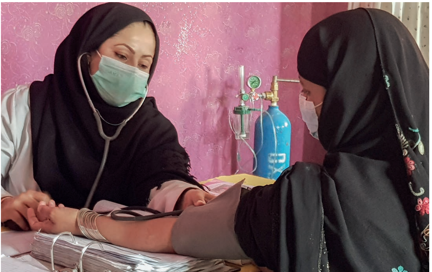
A patient at a consultation.

Both clinics supported by SwissRelief continued running without interruption during the crisis. Together, they treated about 240 people per day in the surgery department, dressing department, obstetrics department with pre- and postnatal care, dental department, vaccination department, eye department and more. Nearly all patients received free medication from the pharmacy. The clinics also continued to conduct programs on health education. This benefited an additional 75,000 people in 2022. Health and hygiene education help people to prevent diseases, which significantly improves living conditions. One mother said: “If this clinic were not here, life would be impossible. I am so thankful that we have this clinic and that they always help the poor people!” ●