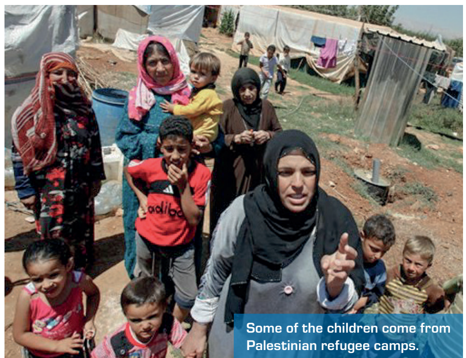
Some of the children come from Palestinian refugee camps.

peaceful coexistence. In afternoon classes, we furthermore supported young people in computer and English courses. Moreover, we conducted vocational orientation courses for our young people and accompanied school graduates through their first vocational training courses. ●