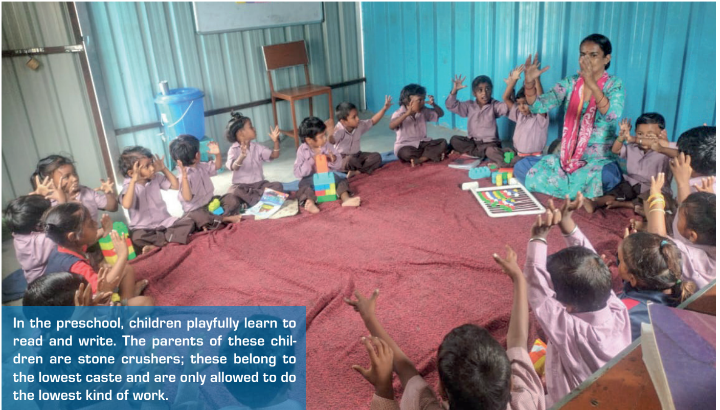
In the preschool, children playfully learn to read and write. The parents of these children are stone crushers; these belong to the lowest caste and are only allowed to do the lowest kind of work.

The pandemic has not yet disappeared, but the number of infections is decreasing. In addition, there were heavy rains last year which led to flooding in many villages and washed away roads. Nevertheless, we were once more able to realize several projects in 2022, including: school education, literacy, support in income generation, informing people about their rights and opportunities as employees, trainings in agriculture and health, programs for women, vaccinations, dental treatments as well as awareness programs on hygiene, cleanliness, child labor and human trafficking.