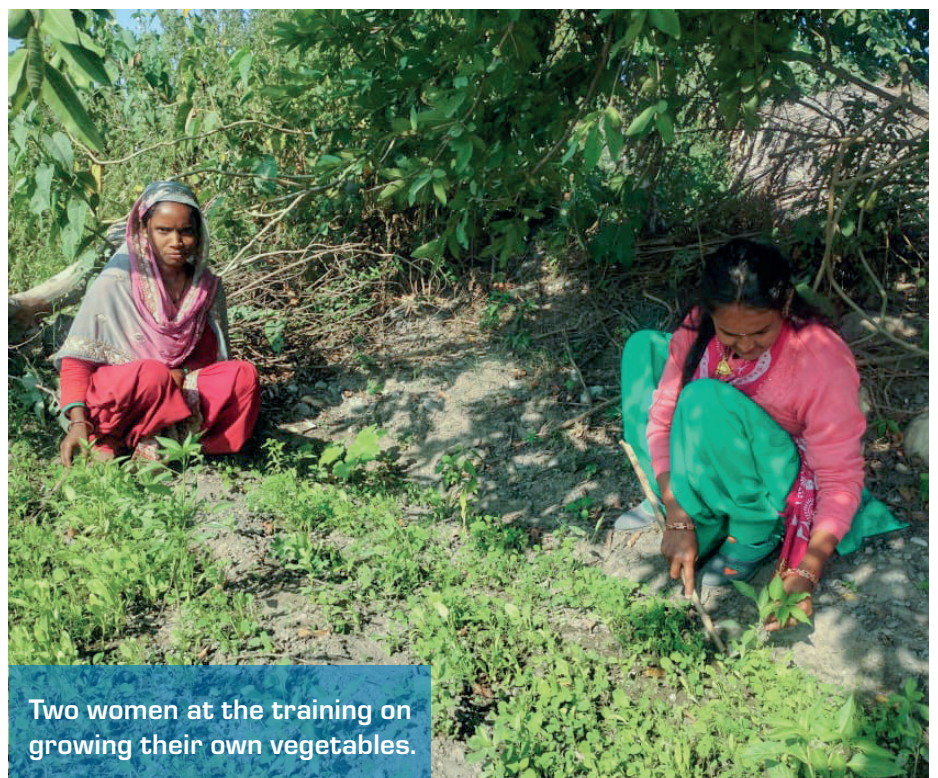
Two women at the training on growing their own vegetables.

various seeds to plant in their own garden. The enthusiasm of the participants was clearly visible and most of them afterwards decided to plant their own vegetable garden. ●