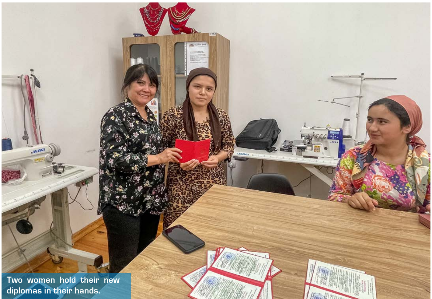
Two women hold their new diplomas in their hands.

The three training centers in Dushanbe were fully equipped with new furniture and sewing machines with the support of UNFPA. In the two other centers in Vahdat and Rudaki, the curricula for the training courses were revised. In 2023, 715 women were trained in vocational skills and 141 received official diplomas. Psychological treatment, legal assistance, English classes and business training were also offered and the team conducted more than 70 awareness-raising seminars among women, men, managers, doctors and others. ●