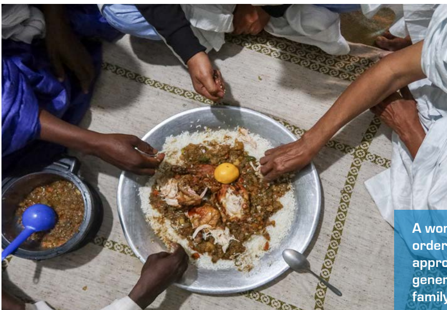
A woman is trained to prepare menus to order. She can do this at home with the appropriate equipment. Home sales now generate enough income for her and her family.

Another partner of SwissRelief helps people as a lawyer and organizes campaigns to sensitize the population about various issues. These campaigns inform people about the basics of human rights and the need to protect minorities. He also draws attention to the dangers of hate speech on social media and provides strategies for dealing with it. As a result, five people affected by hate speech were helped in a practical way: They were temporarily taken to safety in a different location, where they lived until it was safe for them to return. ●