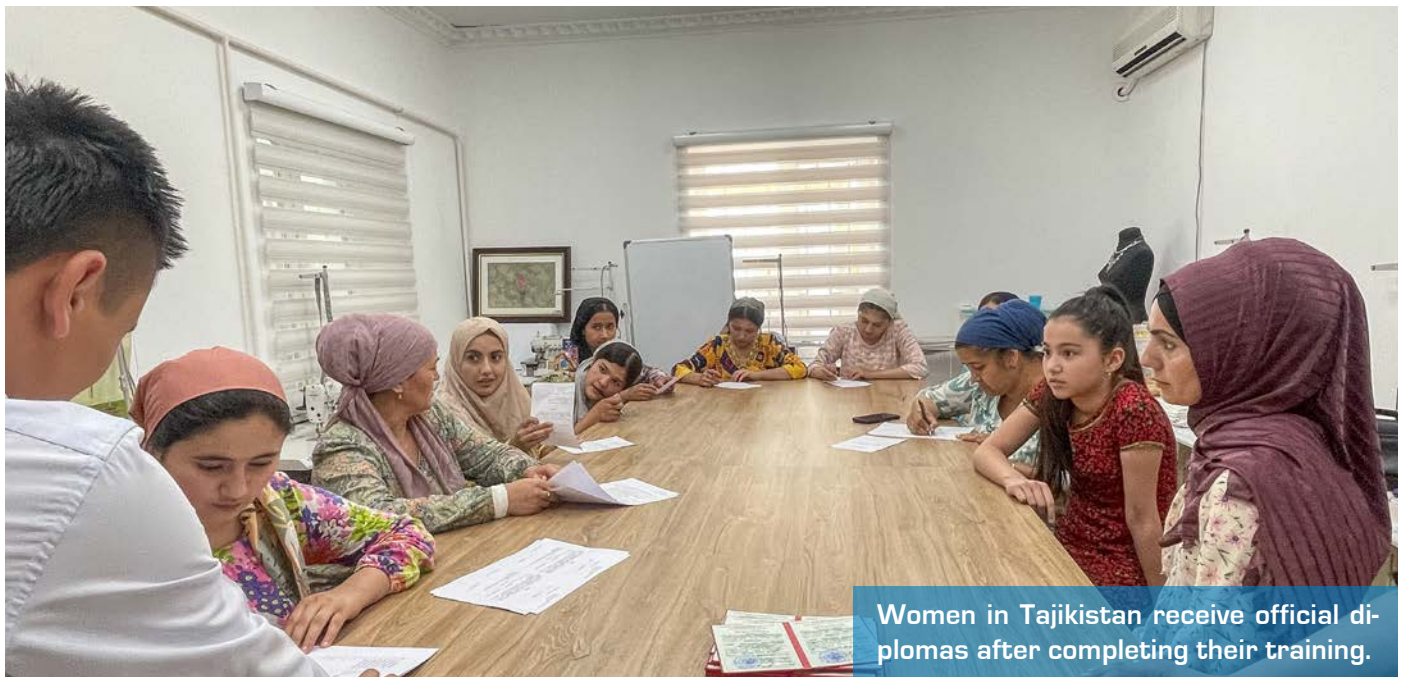
Women in Tajikistan receive official diplomas after completing their training.