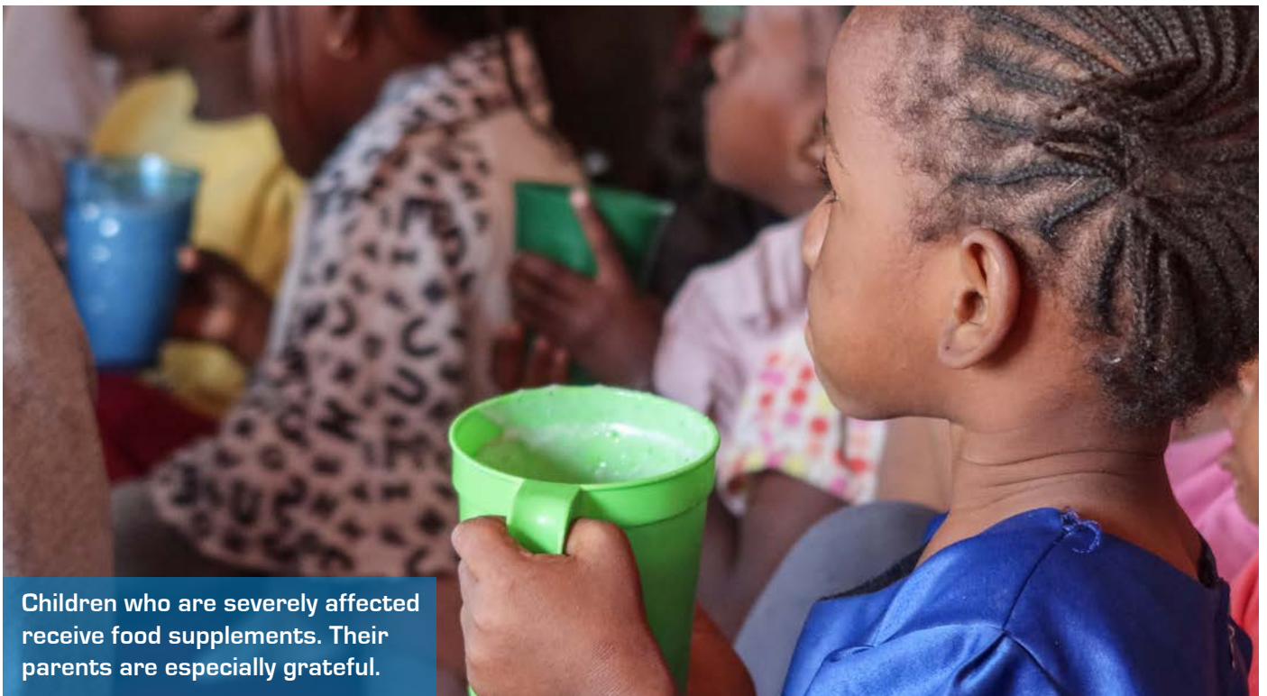
Children who are severely affected receive food supplements. Their parents are especially grateful.

The name of SwissRelief's partner organization translates as "mutual help and solidarity for the people." And that is exactly what SwissRelief is doing in Mauritania. Unfortunately, the economic situation in the country continues to deteriorate. The partner organization has reacted to the difficult current situation. For example, it provided food for 200 malnourished children in a poor district. The regular distribution of supplementary food was carried out