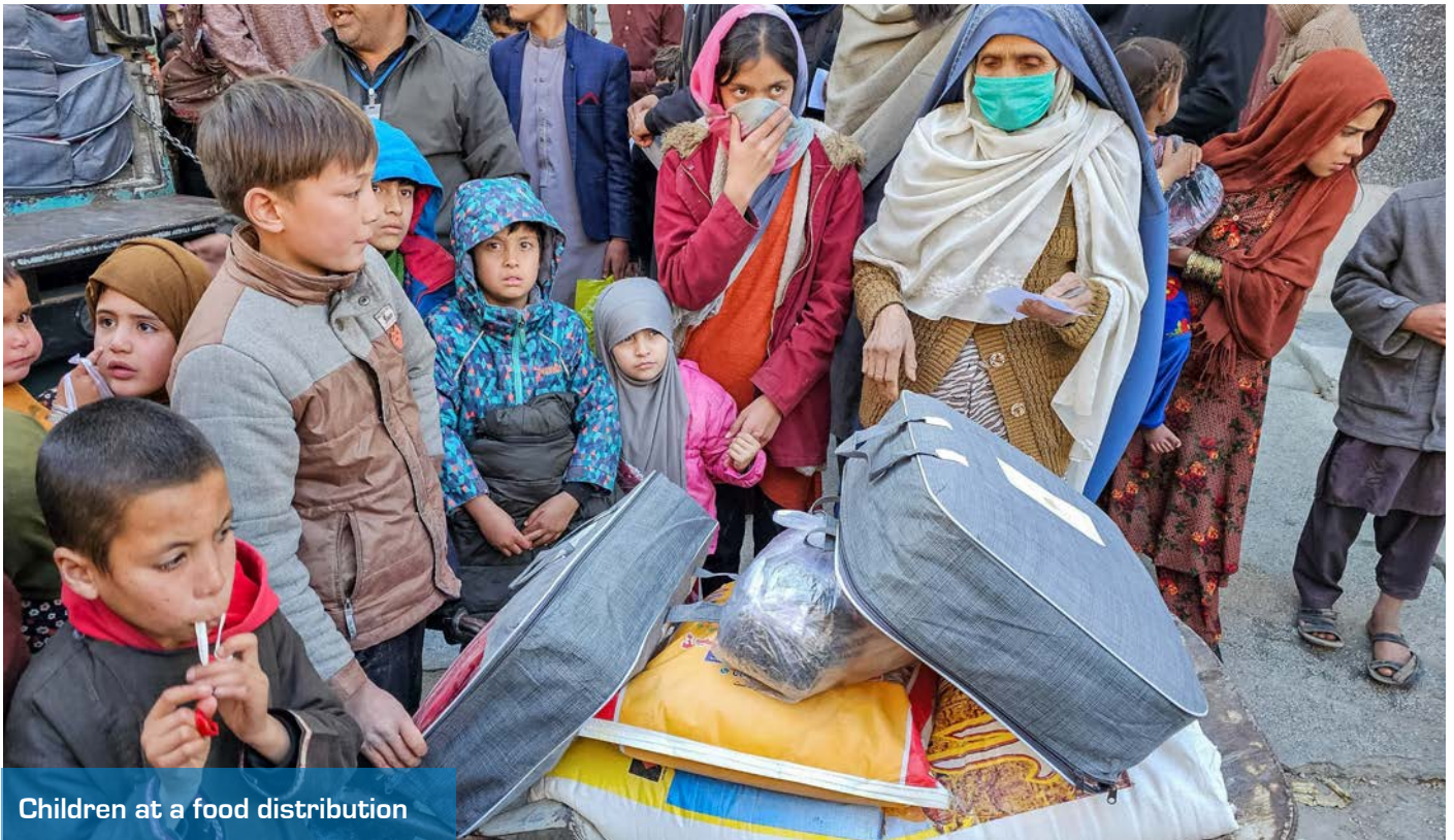
Children at a food distribution

The situation in central Asia is continually deteriorating due to the activities of extremist groups. Companies are closing, civil servants and pensioners are not being paid, the economy is in ruins and unemployment is high. The restrictions on women in the labor market have deprived many families of their last source of income. Many families can not even afford to buy enough food although it is available on the market. As a result, 15.3 million people are currently affected by acute food insecurity – especially widows, people with disabilities and internally displaced persons. Approximately every third child in the country is malnourished. SwissRelief supported these population groups with the distribution of food parcels. In 2023, over 25,200 families received food for one month as well as blankets and winter clothing for children.